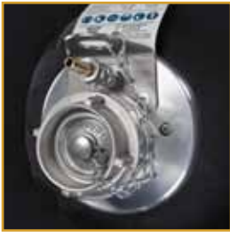
*OFT Pipe plug with bypass

All models suitable for testing according to NEN-EN 1610